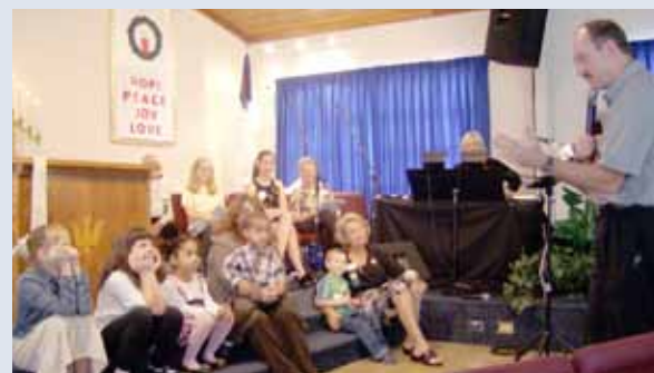
Amazing Grace Lutheran Church, Oxford, Fla., pages 4, 7